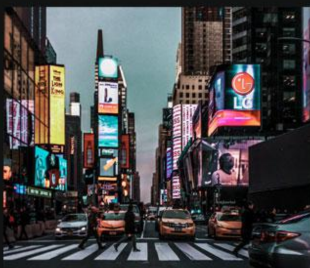
Super Star Light Level Sensor